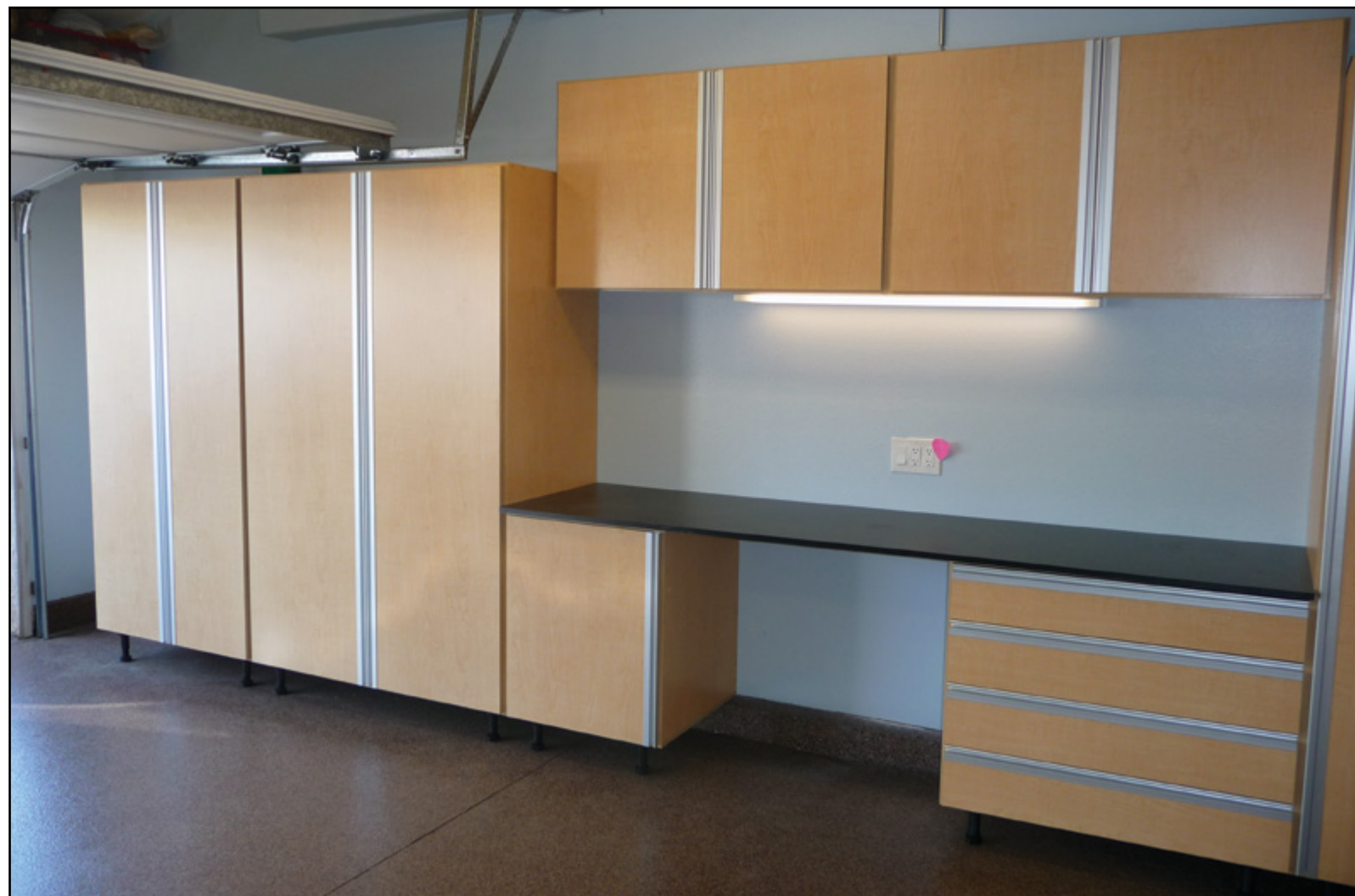
Your Garage Could Look This Good!

Our panels are the first in the industry to be licensed with Composite Panel Associations' Environmentally Preferable Product (EPP) downstream program.