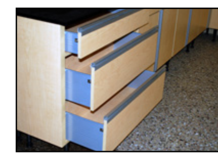
__Meta-Box Style Drawers allow you to have easy access to the back of the drawer.